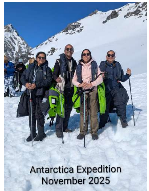
Antarctica Expedition November 2025